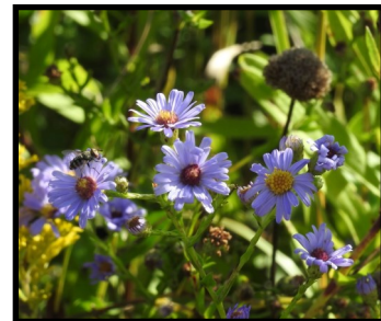
Sky Blue Aster